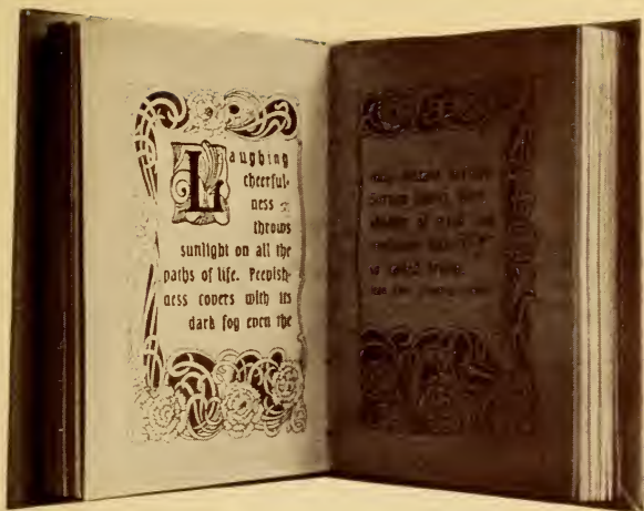
The little book Fanny Crosby always held in her hand when speaking in public